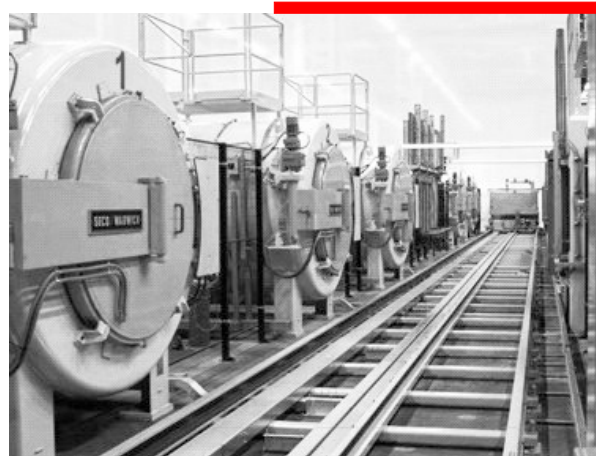
Fig. 1 Picture of the nitrocarburizing system at work

The line is completely automated and self-operating (with safety monitoring), with charges loaded and unloaded by a robot. The working space of the system is 800/800/1500 mm (W/H/L) and gross mass up to 2000 kg that enables the customer to reach productivity as high as 1000 kg of gears per hour.